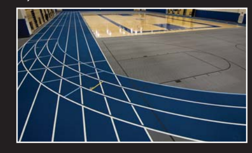
Perfect For Indoor & Outdoor Tracks

Running tracks made with SportLastic® Track are durable enough to withstand the combined effects of compaction, abrasion, spike damage ultra violet light, water, moisture and temperature extremes.